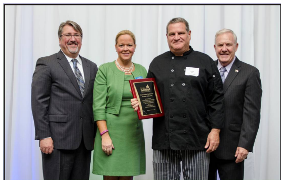
Member of the Year: Chuck's Southern Comforts Café in the Village of Burbank