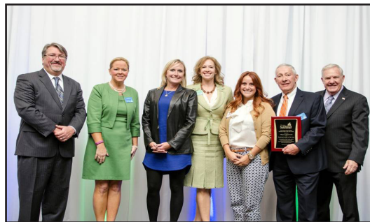
Patricia Chase Magon Municipal Leadership Award: The Village of Homewood